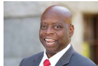
Al Murray ,