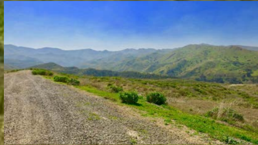
Pictured above are 283 acres of County land reserved for a potential veterans' cemetery.