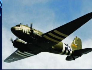
C-47 "WILLA DEAN"

2:00 PM - ORANGE 2:15 PM - BUENA PARK 2:30 PM - LA HABRA