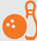
Indoor Family Entertainment Centers