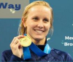
Meet Olympic Gold & Bronze Medal Winner Jessica Hardy!

Don't forget your masks & to practice social distancing